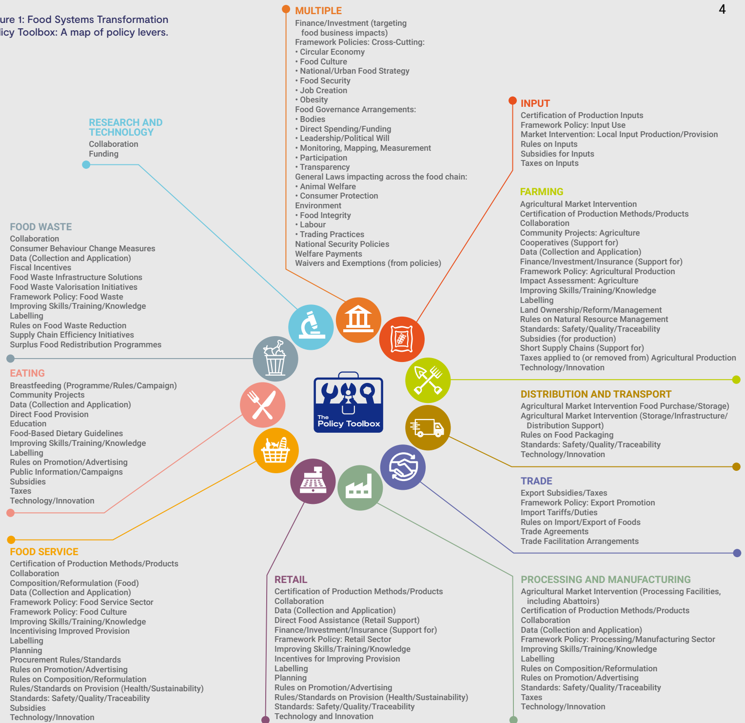
Figure 1: Food Systems Transformation Policy Toolbox: A map of policy levers.

A more granular mapping of the levers applied at each segment of the chain, alongside implemented examples drawn from the inventory created for the analysis, is presented as an Appendix to the main report.